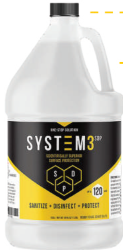
Patent Pending Formula

Antimicrobial, water-based technology is merciless on bacteria and viruses but exceptionally gentle on skin