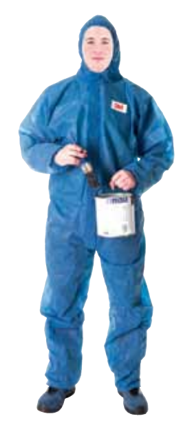
3M<sup>™</sup> Protective Coverall 4500 Colour: White, Blue CE Category I Sizes: S-4XL